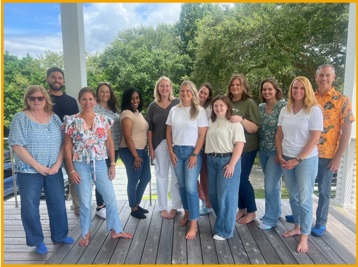
*Pictured: Current Child Advocacy Center Staff

Want a behind-the-scenes tour of the Child Advocacy Center? Click here to let us know!